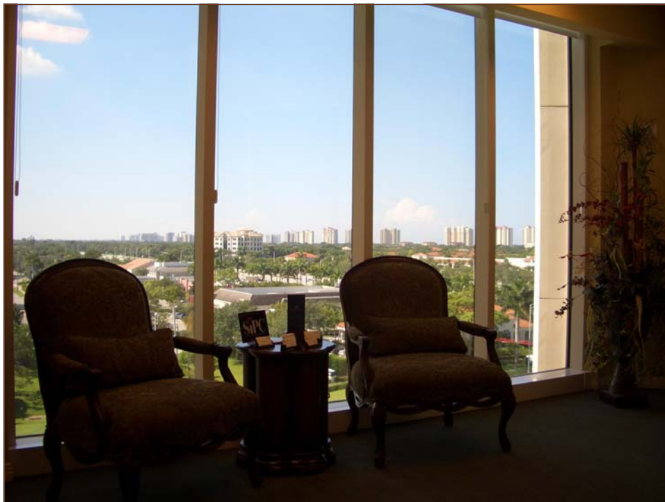
VIEW FROM SIXTH FLOOR